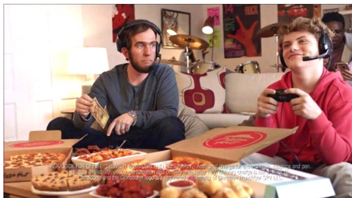
Father and Son Playing a Console Game

Linguistic evidence for the presumed obsession of men over gaming can be taken from AD52 with the slogan: “ Level up with the 5$ lineup” (AD52). This double entendre refers to both the types of meals provided by the restaurant and the level advancement in a game. Generally, the importance of gaming is portrayed to retain over time and stages in the life of a man; gaming is integrated into men's daily life, from meeting up with their friends, travelling, father-and-son bonding, and even in what they eat every day. In addition, men are frequently seen in other competitions, including a parody of a dog show in which humans instead of dogs are lined up to compete for a prize (AD35), and a duel between two knights (AD36).